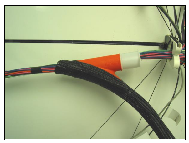
The "spreader" of the tool is then inserted into the PowerBraid. With the tool inserted, pull the tool down the length of the PowerBraid. This will insert the harness into the braid as it is pulled.